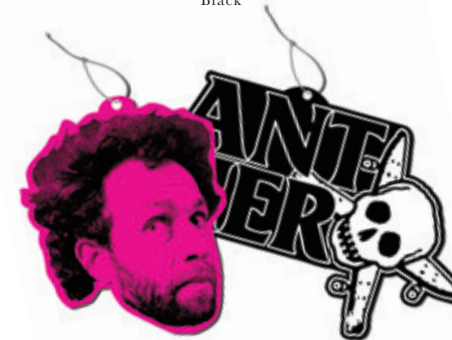
AIR FRESHENER PACK - FA442 ASSORTED