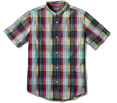
GONZ IKAT S/S - FS116498 Navy