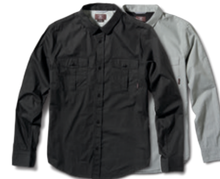
ORTEGA L/S - FS116405 Black & Olive