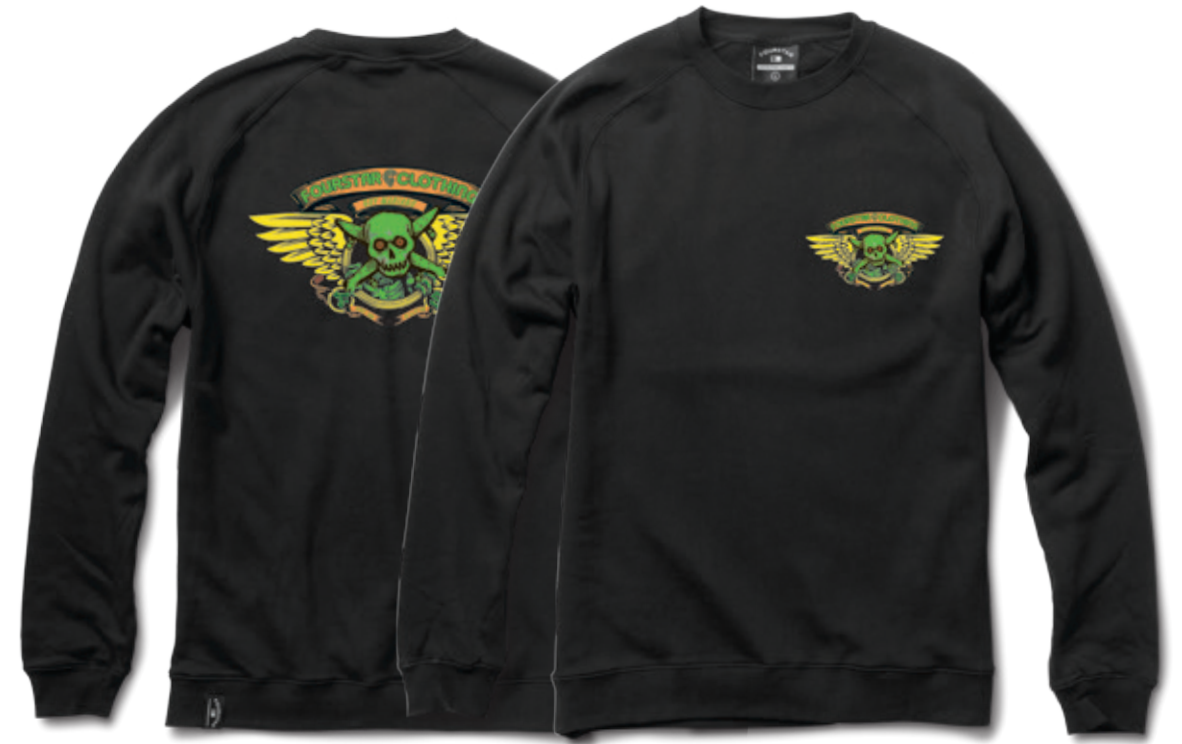
MARIANO CREW - FSW116201 Cottonpoly blend crew neck. Standard fit. Available in Black.