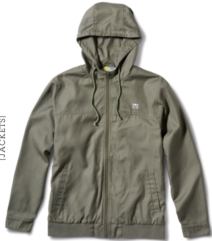
ATLAS TWILL JACKET- FS116610 Full-zip cotton/poly twill shell jacket with scuba hood. Embroidered Street Pirate patch at left chest. Gusseted armpits w/ eyelets. Welt pockets at waist. Rib waistband. Men's sizes S-XXL Color: Olive