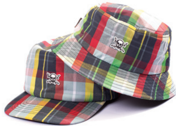
GONZ IKAT CAP & BUCKET - FH116207 & FH116209 Unstructured cap & Bucket hat with Large-scale multicolor Ikat specialty weaving process. Shares fabric from Gonz signature woven. Available in Navy. Bucket - Sizes S/M & L/XL. Cap - OSFA.