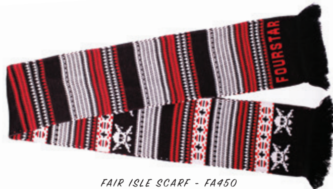
FAIR ISLE SCARF - FA450 Multi color