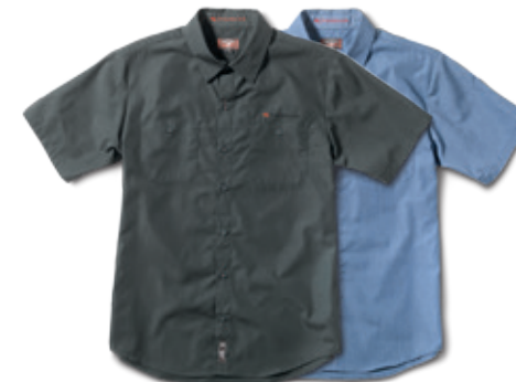
MAX S/S WORKSHIRT - FS116494 Seafoam & Pale Blue