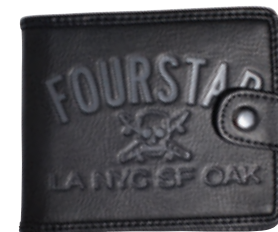
MATAMOROS WALLET - FA401 Black