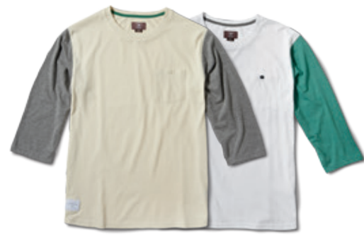
LEAVENWORTH ¾ - FS116343 Ecu & White