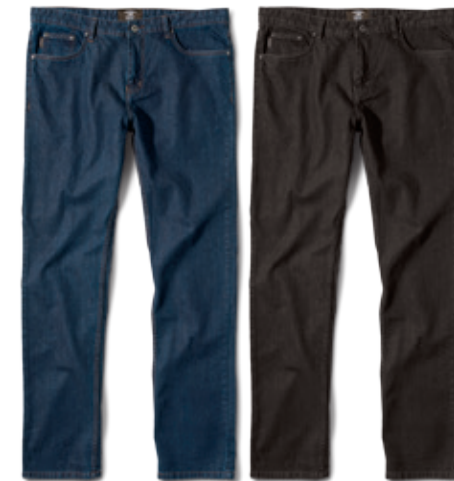
COLLECTIVE JEAN STRAIGHT SLIM - FS116100-SS Dark Rinse & Black/Black