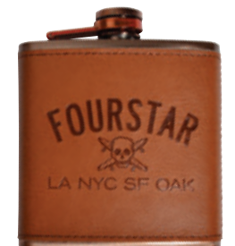
EL PASO FLASK - FA403 Brown