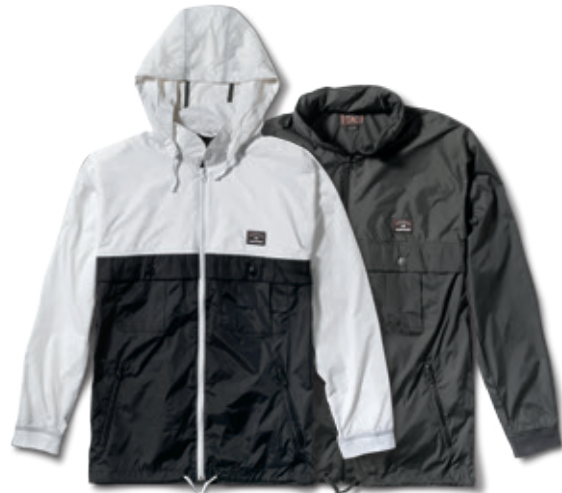
ISHOD TOUR JACKET - FS116601 White & Charcoal