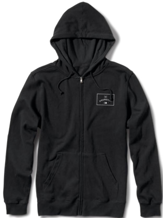
BOX LOGO FULL ZIP - FSW116302 Cottonpoly full zip fleece. Standard fit. Available in Black.