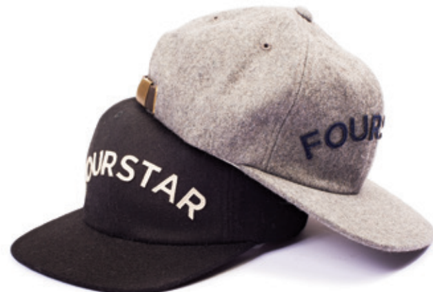
ARCHED APPLIQUE - FH116297 Unstructured melton wool with leather & brass strap closure. Vintage silhouette with felt applique. Available in Black & Grey Heather.