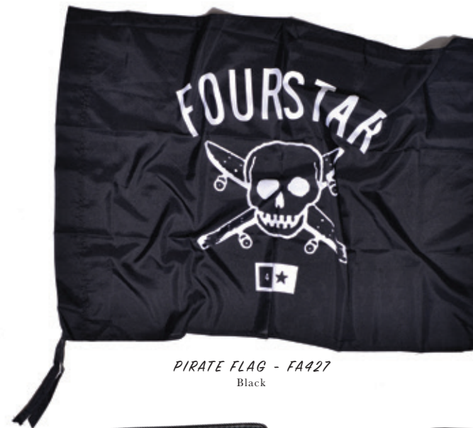
PIRATE FLAG - FA427 Black

Mid-size nylon backpack with two full compartments including laptop sleeve, large front pocket and padded back panel. Luggage tag, logo print and Fourstar label package. Colors: Black