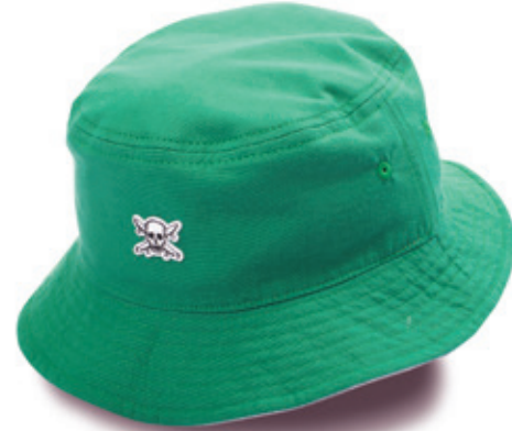
MARIANO REVERSIBLE BUCKET - FH116208 Bucket hat with reversible oxford fabric shared with the Mariano s/s woven. Available in Turf Green / Grey. Sizes S/M & L/XL