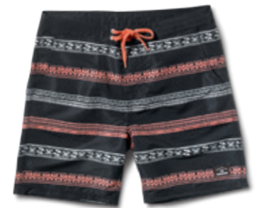
KENNEDY TRUNK - FS116892 Midnight