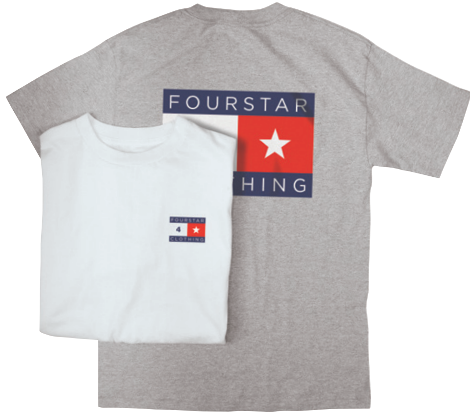
LOCKWOOD STANDARD - FTS116015 100% Combed ringspun cotton with waterbased screen print. Standard Fit. Available in White & Heather Grey.