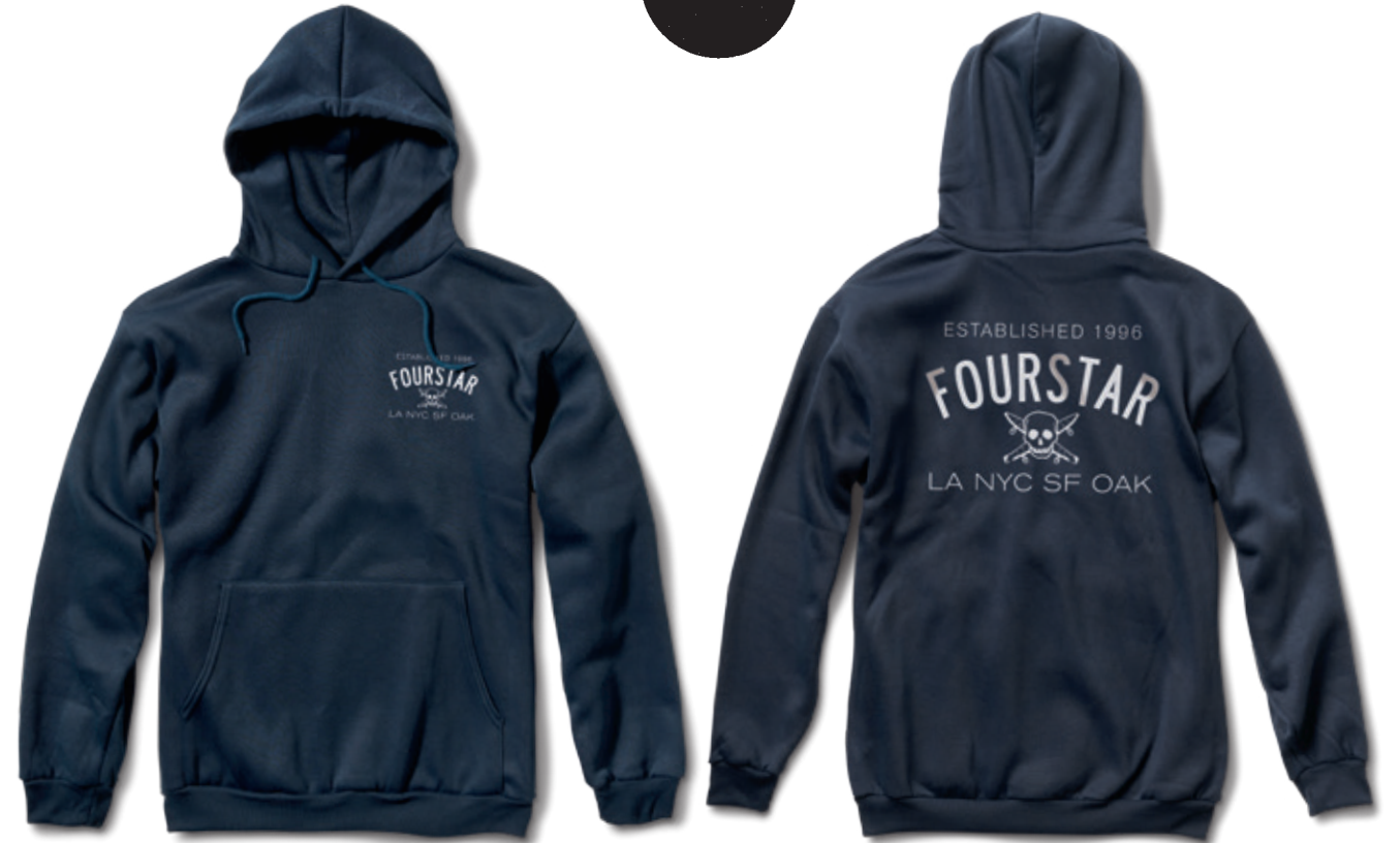
CLASSIC HOOD - FSW116101 Cottonpoly pullover fleece. Standard fit. Available in Navv.