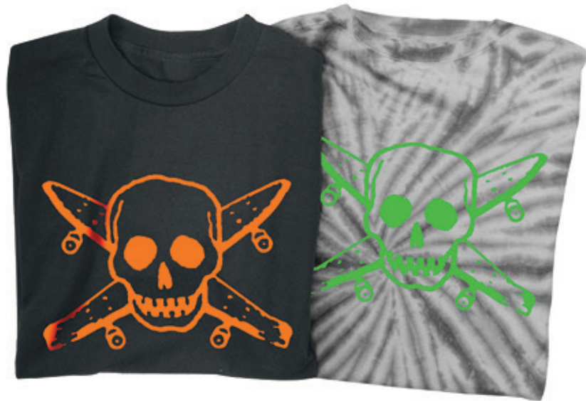
PIRATE STANDARD - FTS116014 100% Combed ringspun cotton. Standard fit. Available in Black . PIRATE TIE DYE - FTS116901 100% Combed ringspun cotton with Tie Dye wash. Slim fit. Available in Charcoal Tie Dye.