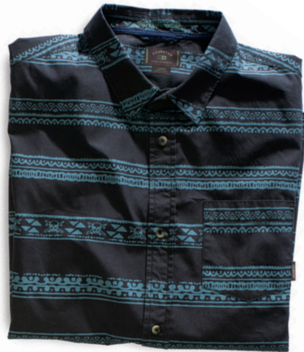
KENNEDY S/S - FS116499 Cory Kennedy signature style. Cotton poplin with custom Kennedy Native print stripe. Tortoise buttons and contrast neck tape. Monogram hip and interior collar embroideries. Cory Kennedy label package. Men's sizes S-XXL. Colors: Grey and Midnight