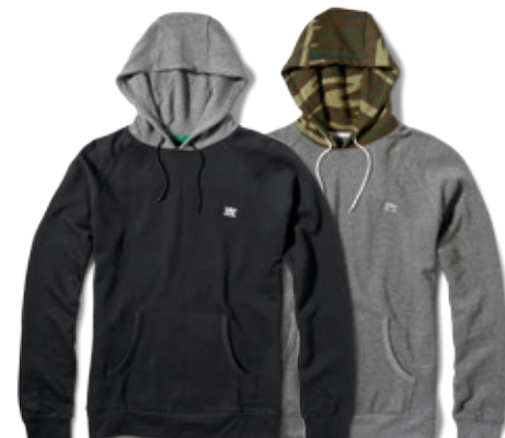
MARIANO HOOD - FS116581 Black & Grey Heather