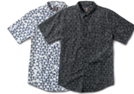
MONTANA S/S - FS116400 White & Black