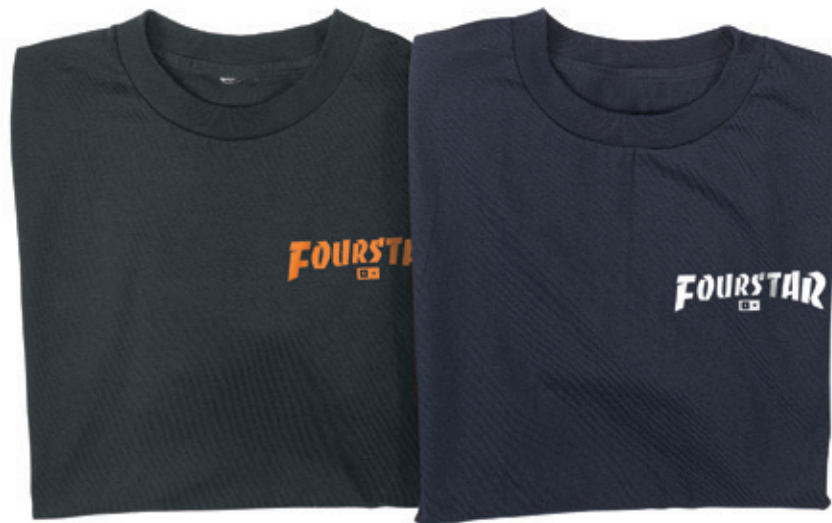
HIGHSPEED STANDARD - FTS116006 100% Combed ringspun cotton with waterbased screen print. Standard Fit. Available in Black & Navy