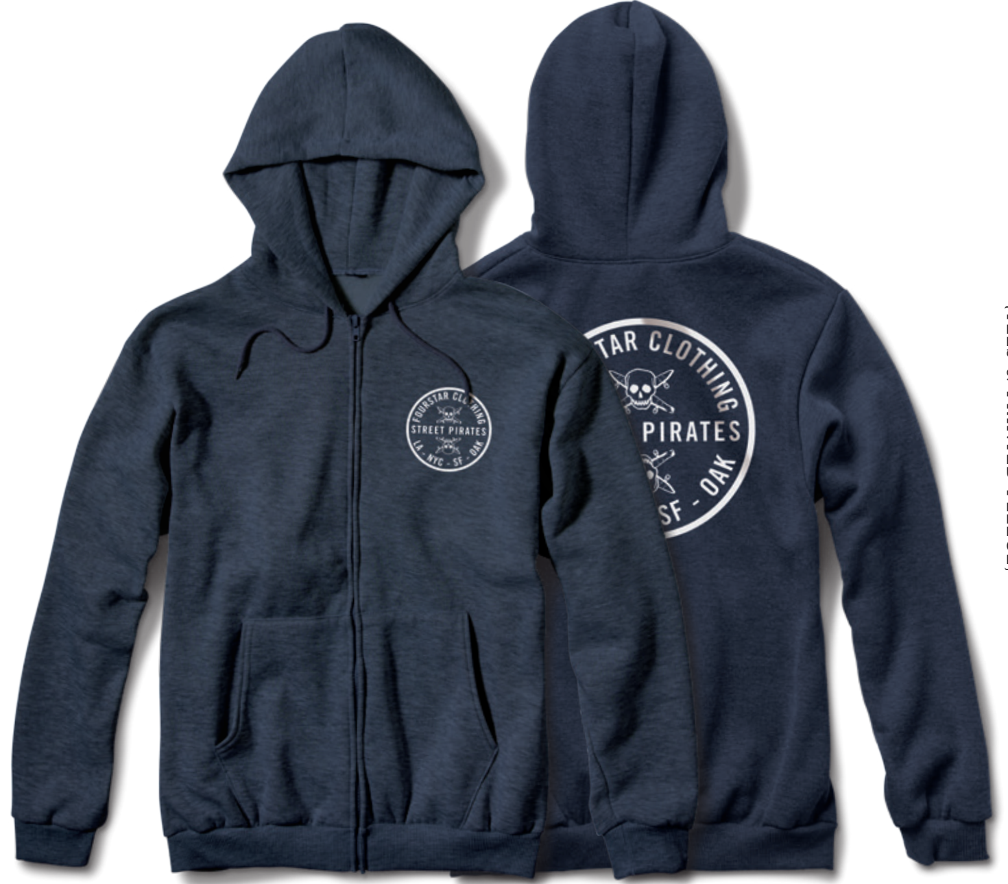
CIRCLE PATCH FULL ZIP - FSW116300 Cottonpoly full zip fleece. Standard fit. Available in Navy Heather.