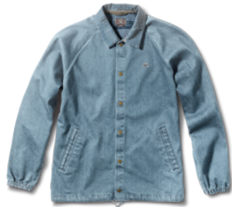
KENNEDY DENIM COACH'S JACKET- FS116607 Indigo