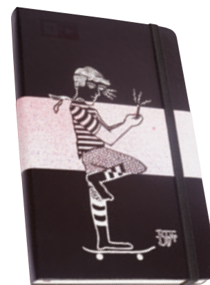
MOLESKIN - FSE003 Black