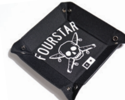
TRAVEL TRAY - FA429 Black