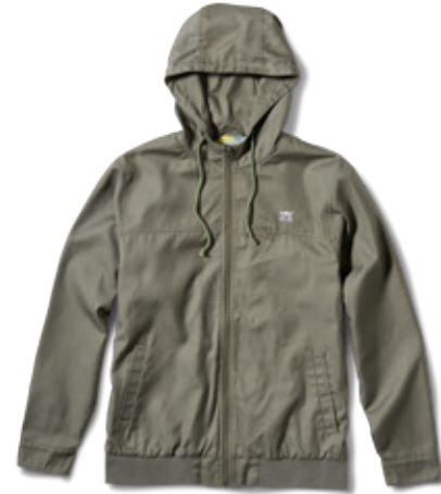
ATLAS TWILL JACKET- FS116610 Olive