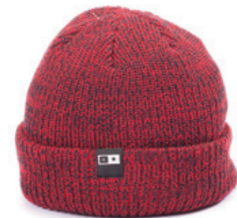
SLUB SHALLOW BEANIE - FH116427 Shallow fit acrylic fold beanie with marled yarns & clamp label. Colors: Black & Red