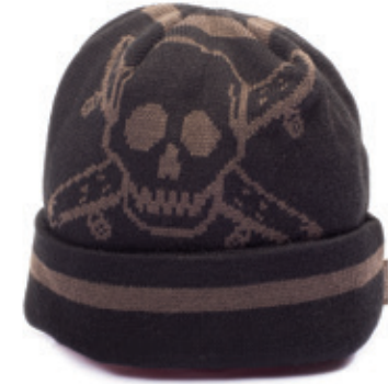
PIRATE INTARSIA BEANIE - FH116428 Acrylic fold beanie with intarsia knit pirate. Available in Royal & Black.