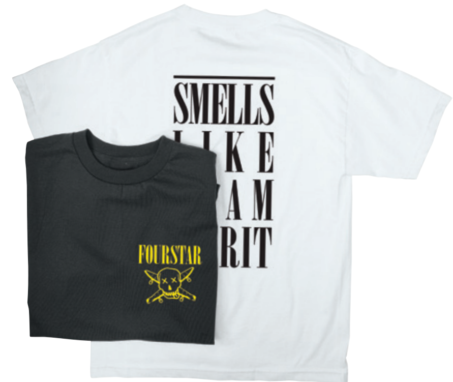
TEAM SPIRIT STANDARD - FTS116003 100% Combed ringspun cotton with waterbased screen print. Standard fit. Available in Black & White.