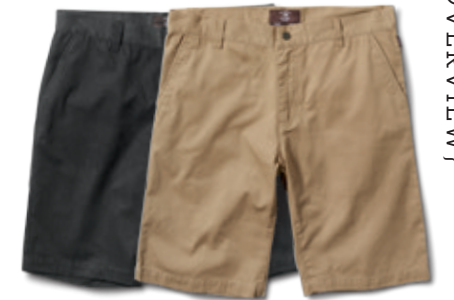
COLLECTIVE SHORT - FS116886 Charcoal Heather & Khaki