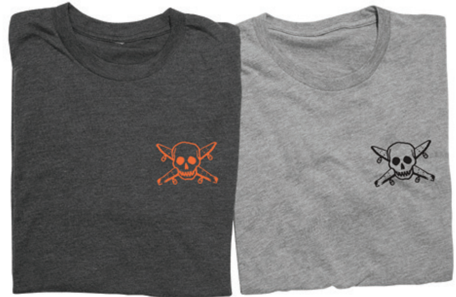
PIRATE TRIBLEND - FTS116500 Cottonpoly triblend with waterbased screen print. Slim fit. Available in Vintage Black & Heather Grey.