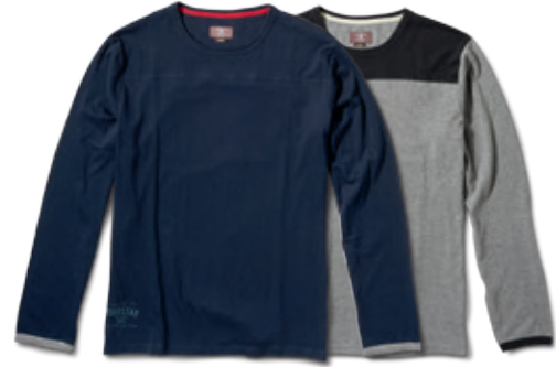
GRIDIRON L/S - FS116349 Midnight & Grey Heather