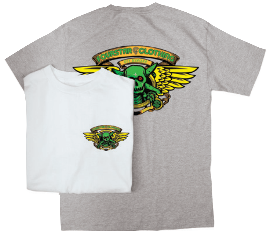
MARIANO PIRATE STANDARD - FTS116005 100% Combed ringspun cotton with Flourescent screen print. Standard fit. Available in White & Heather Grey.