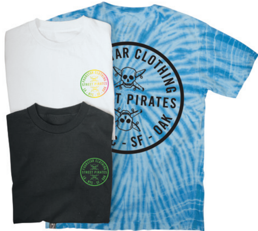
CIRCLE PATCH STANDARD - FTS116016 100% Combed ringspun cotton. Standard fit. Available in Black & White . CIRCLE PATCH TIE DYE - FTS116902 100% Combed ringspun cotton with Tie Dye wash. Slim fit. Available in Royal Blue Tie Dye.