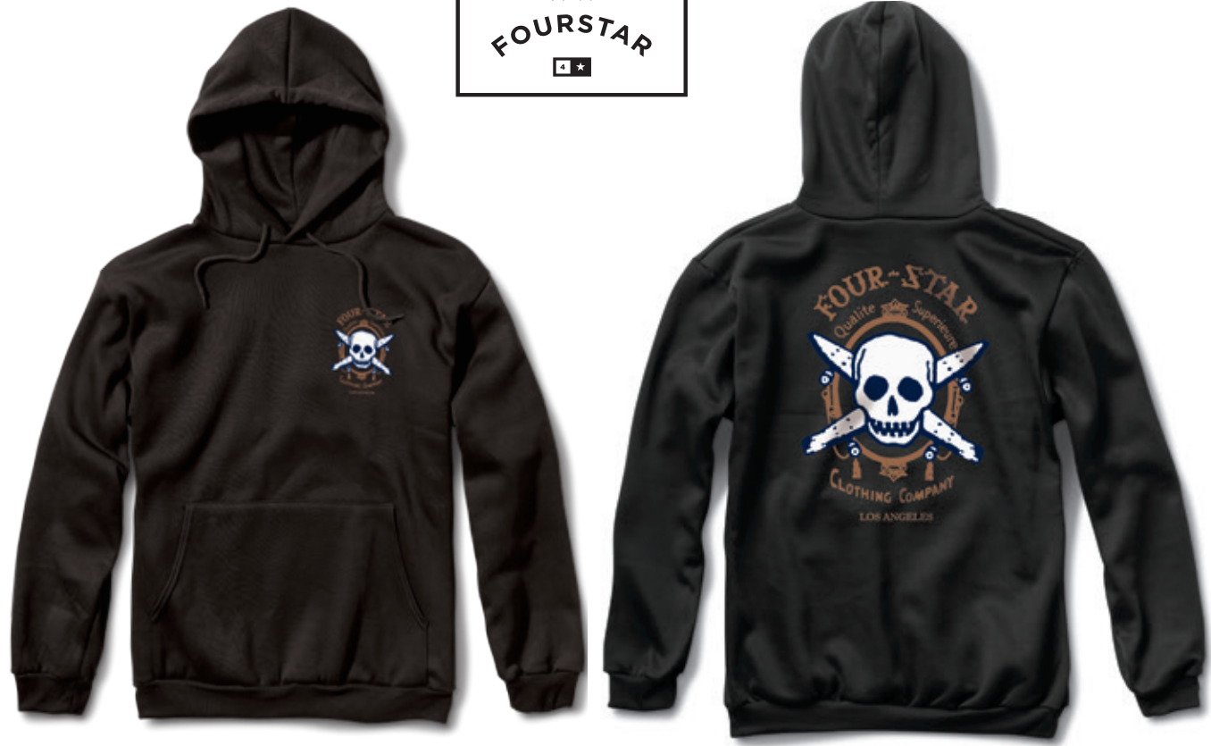
ZIG ZAG HOOD - FSW116102 Cottonpoly pullover fleece. Standard fit. Available in Black.