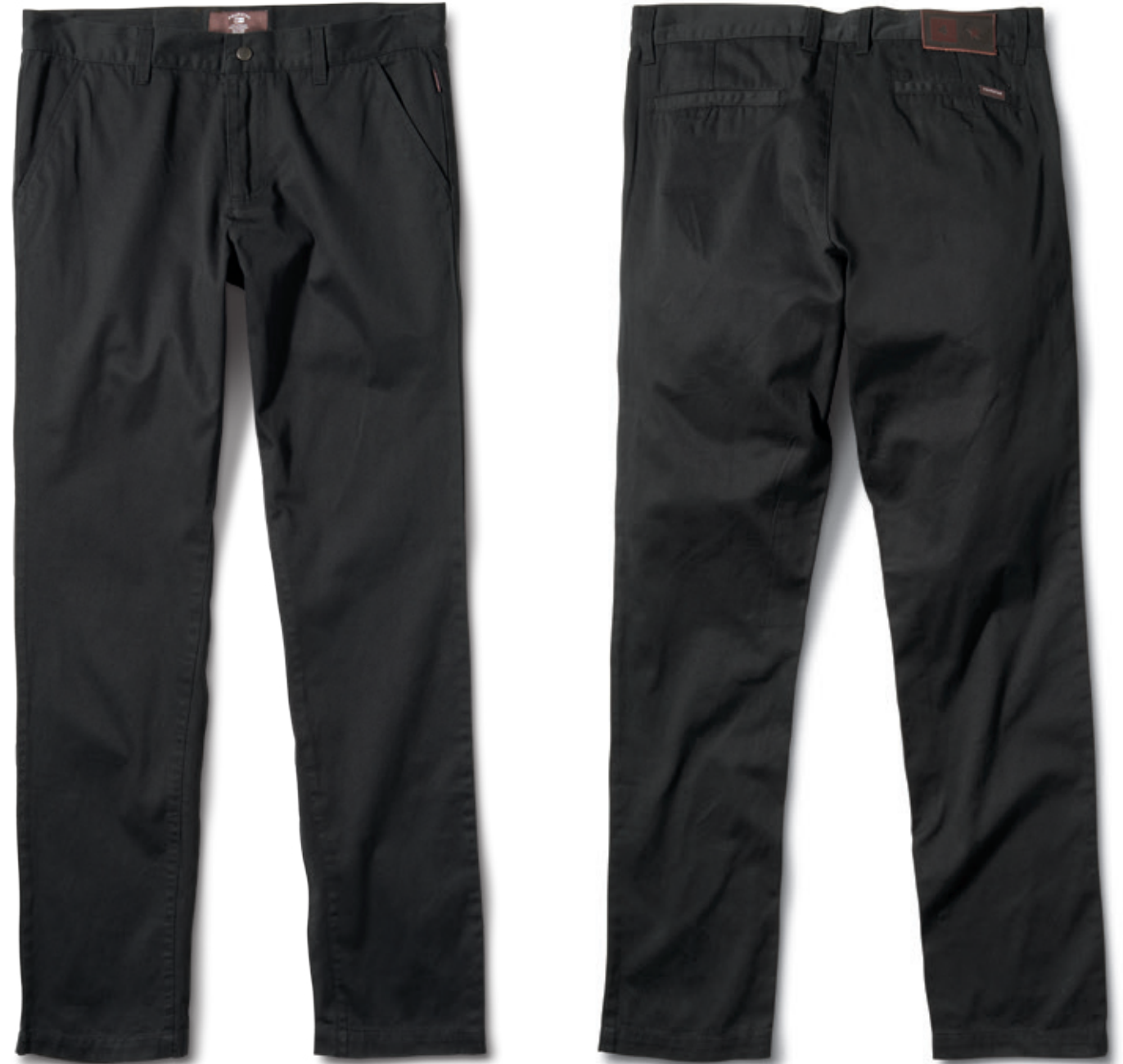
COLLECTIVE PANT STRAIGHT SLIM- FS116200-SS 6.5 oz 60/40 cotton/poly twill Rinse washed. Slash pockets and rear welt pocket Collective label package Men's sizes 28-38 Color: Black