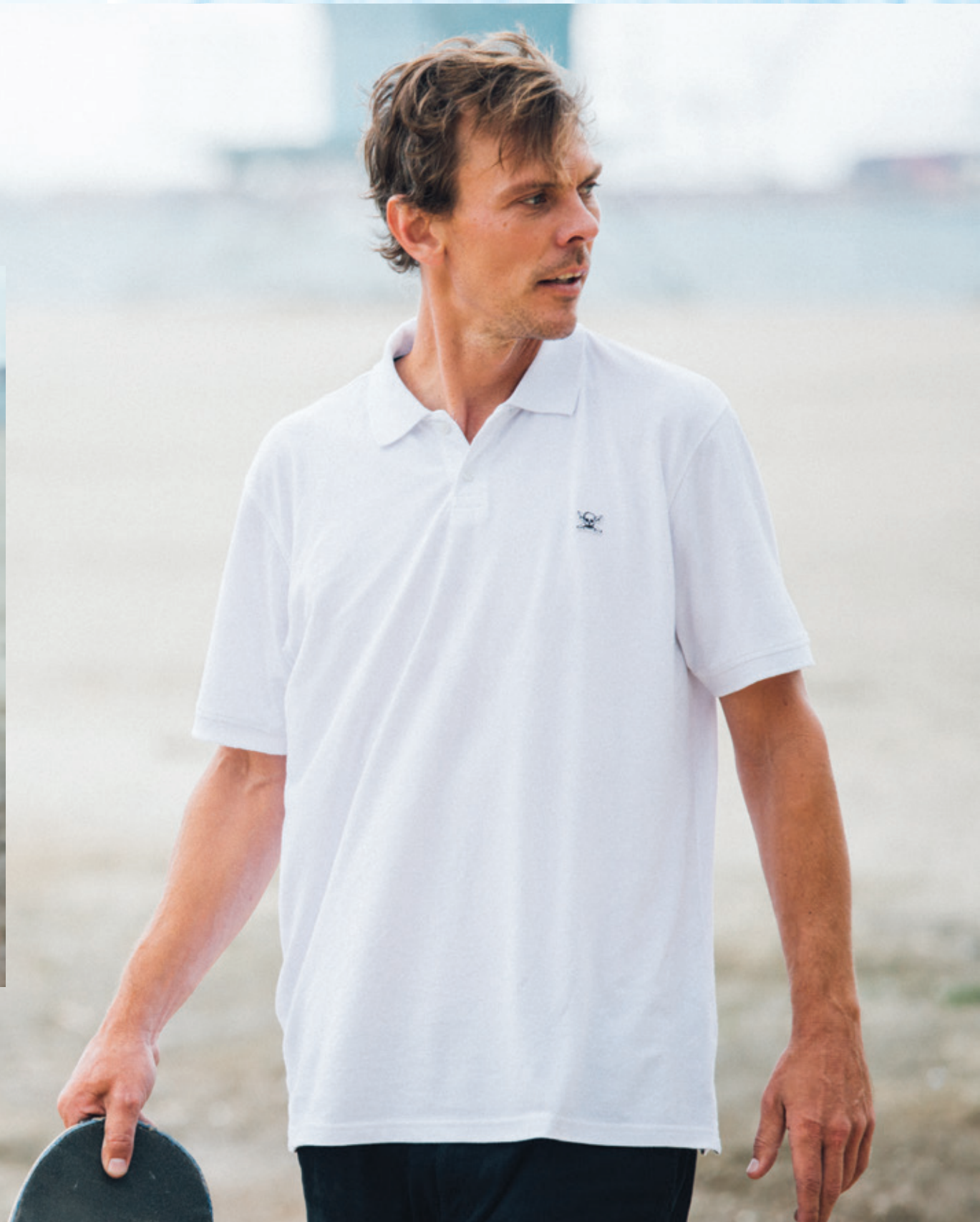
PIRATE POLO - FS116341 165 gram cotton pique polo with two-button placket and rib collar and cuffs. Embroidered Street Pirate patch at left chest. Contrast neck and side vent tape. Collective label package. Men's sizes S-XL. Colors: White and Black