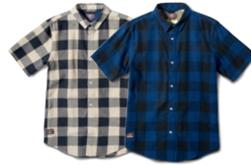
BUFFALO S/S - FS116497 Butter & Dark Royal