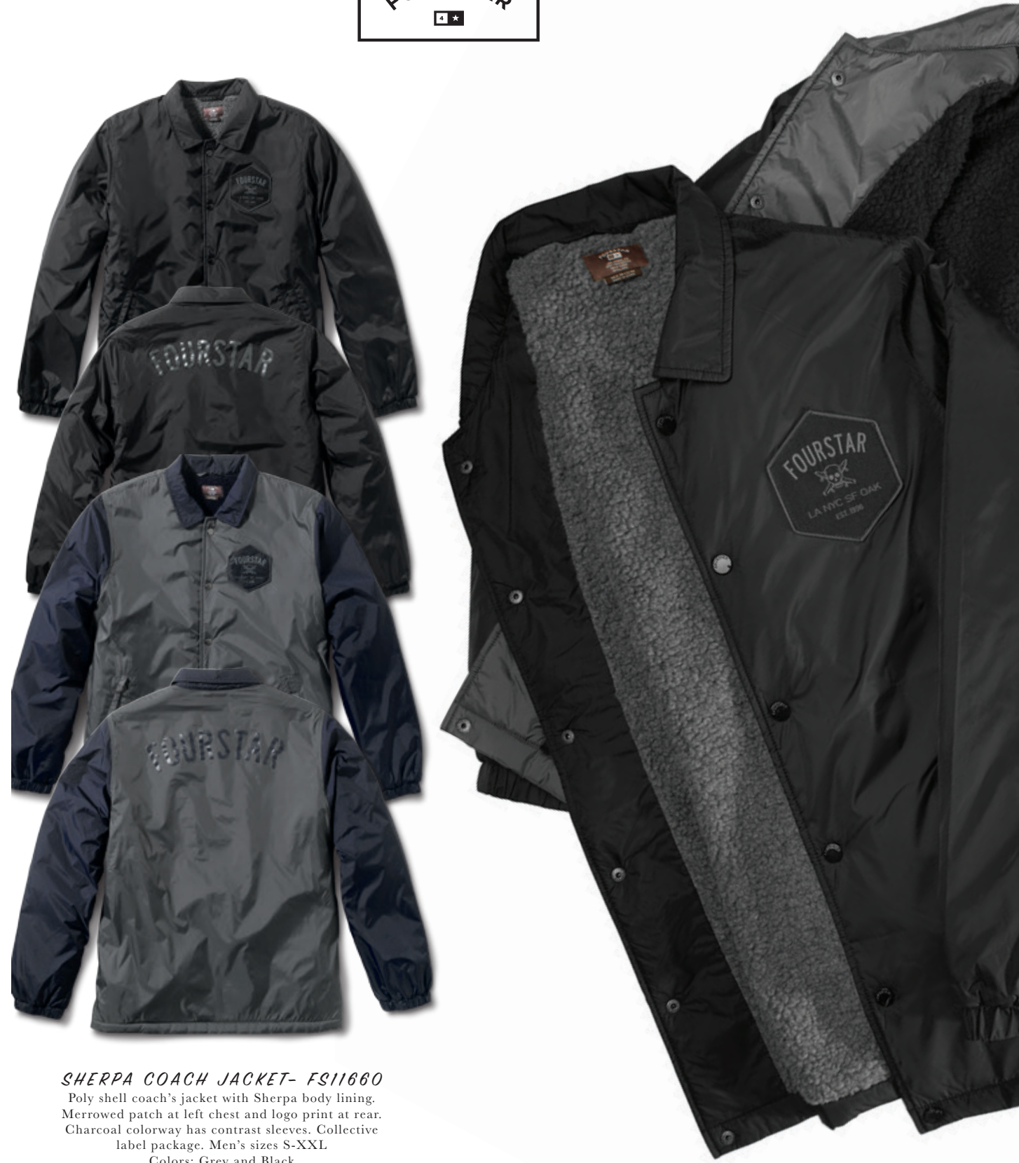
SHERPA COACH JACKET- FS11660 Poly shell coach's jacket with Sherpa body lining. Merrowed patch at left chest and logo print at rear. Charcoal colorway has contrast sleeves. Collective label package. Men's sizes S-XXL Colors: Grey and Black