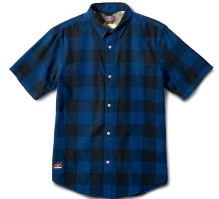
BUFFALO S/S - FS116497 Cotton buffalo flannel with left chest pocket. Contrast buttons. Collective label package. Men's sizes S-XXL. Colors: Butter and Dark Royal