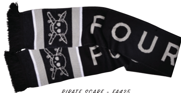
PIRATE SCARF - FA425 Black