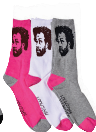
LEGEND SUBLIMATED CREW - FA423 Pink / White / Grey Heather