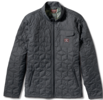
MARIANO CADET JACKET - FS116604 Charcoal