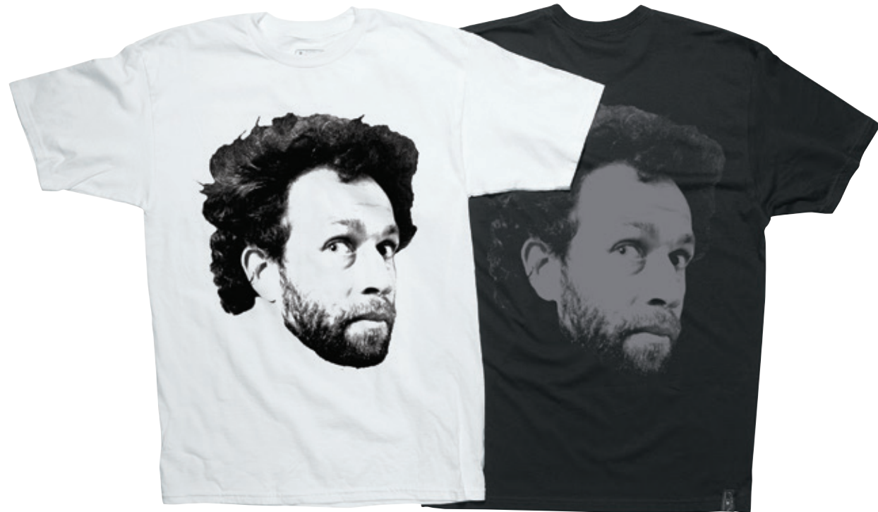
LEGEND STANDARD - FTS116013 100% Combed ringspun cotton with waterbased screen print. Standard fit. Available in Black & White.