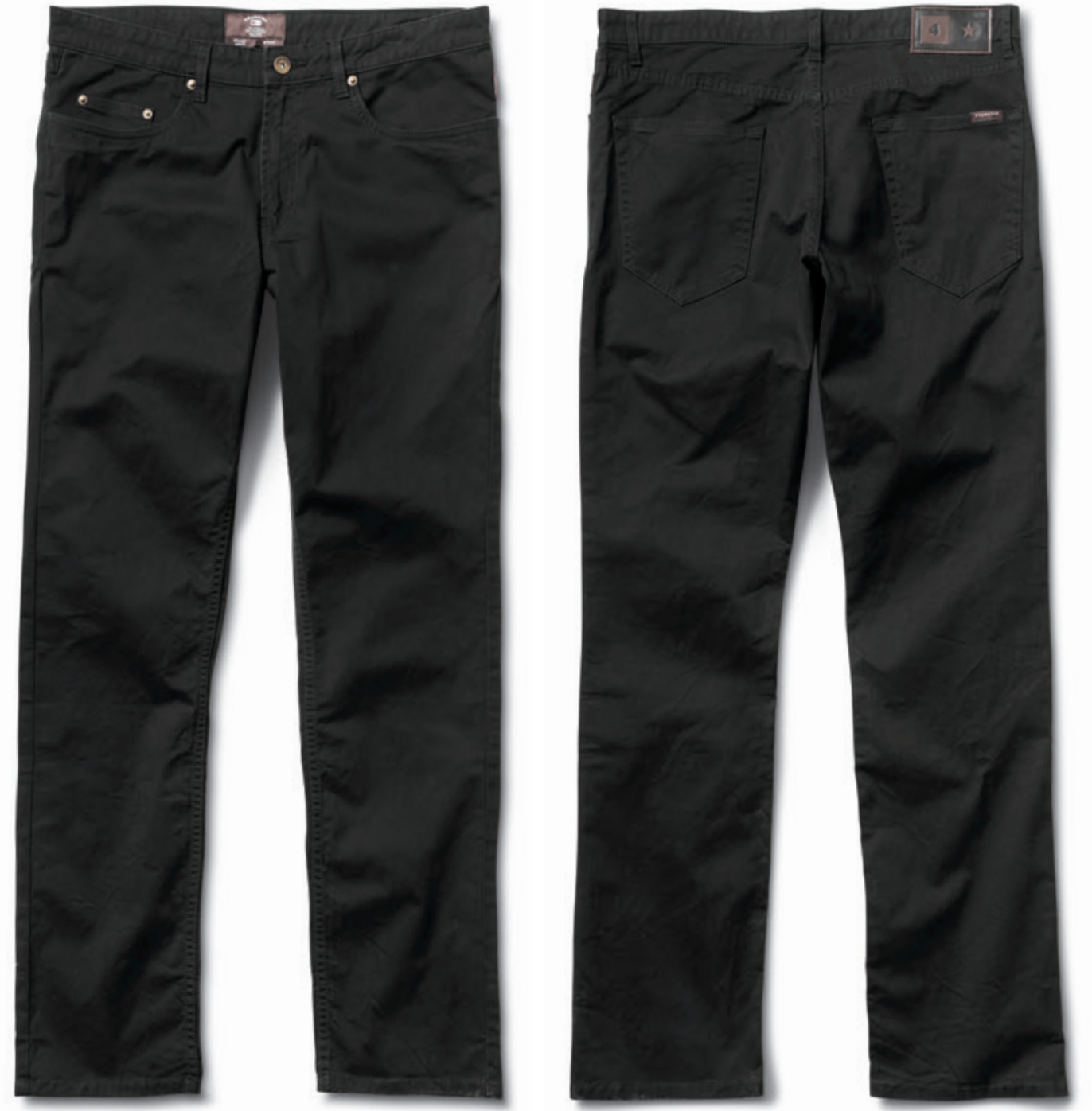
COLLECTIVE JEAN STRAIGHT SLIM - FS116100-SS 9 oz cotton denim with 2% stretch. Five-pocket silhouette. Collective label package. Men's waist size 28-38 Wash 2: Black/Black: Black overdyed with black stitch. Fit: Straight Slim