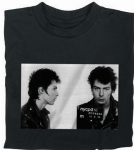
SID MUGSHOT STANDARD - FTS116009 100% Combed ringspun cotton with waterbased screen print. Standard fit. Available in Black.