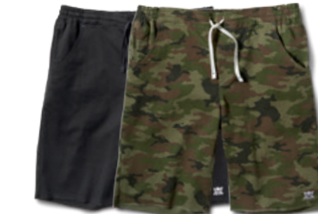
COLLECTIVE DRAWCORD SHORT - FS116881 Black & Camo