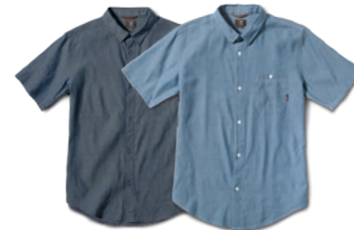
DENTON S/S - FS116495 Midnight & Blue Sky