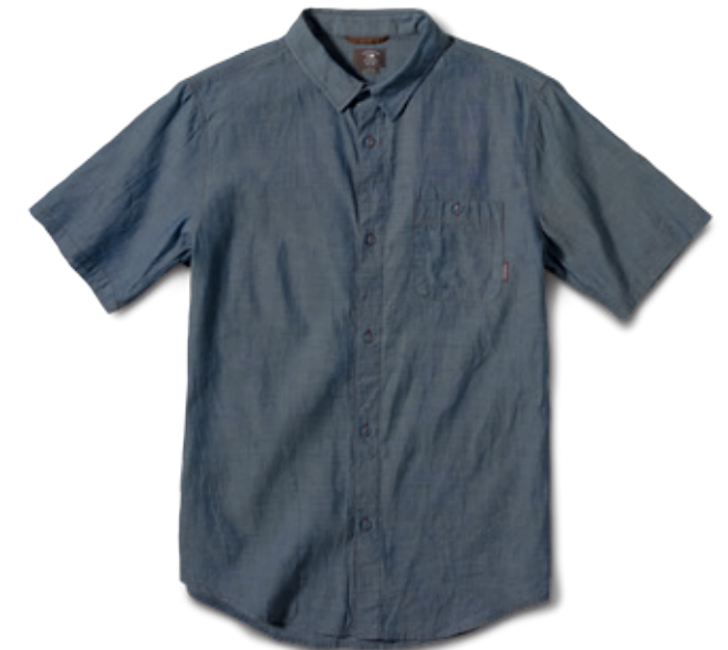
DENTON S/S - FS116495 Lightweight denim with traditional white and golden-brown stitch. Contrast buttonhole stitch and contrast interior yoke. Left chest pocket. Collective label package. Men's sizes S-XXL. Colors: Blue Sky and Midnight