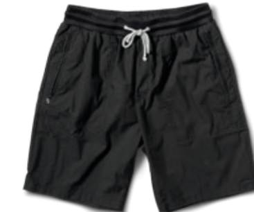
MARIANO LOCKWOOD SHORT - FS116890 Black