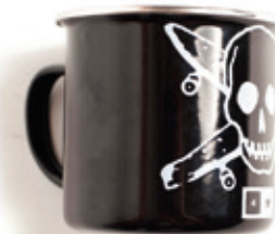
PIRATE ENAMEL MUG - FA278 Black