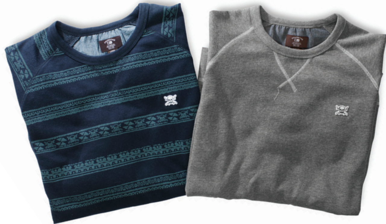
ATLANTIC RAGLAN - FS116583 250 gram cotton/poly fleece raglan crew with welt pocket. Midnight colorway has Kennedy Native repeat print. Grey Heather colorway has contrast stitch. Multicolor interior collar contrast stitch on both colorways. Embroidered Street Pirate patch at left chest. Collective label package. Men's sizes S-XL. Colors: Midnight and Grey Heather.