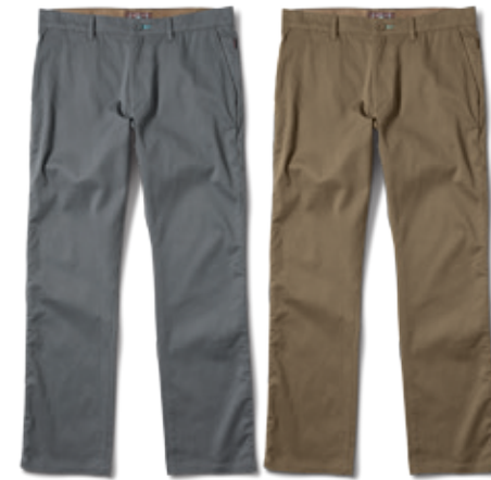
CARROLL TWILL STANDARD - FS116207-ST Charcoal & Khaki