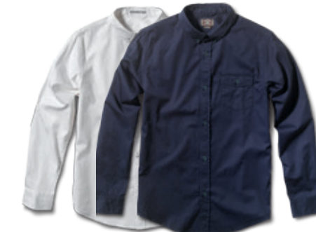
KENNEDY L/S - FS116402 White & Navy