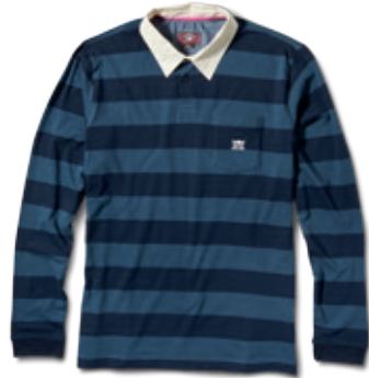
GONZ L/S POLO - FS116346 Thundercloud