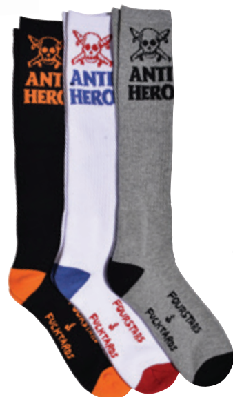
TNT CALF - FA418 Black / White / Grey heather