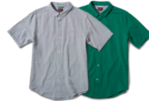
MARIANO OXFORD S/S: FS116496 Grey & Turf Green