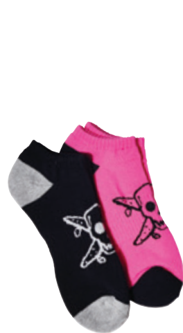
PIRATE NO SHOW - FA421 Black / Pink / White