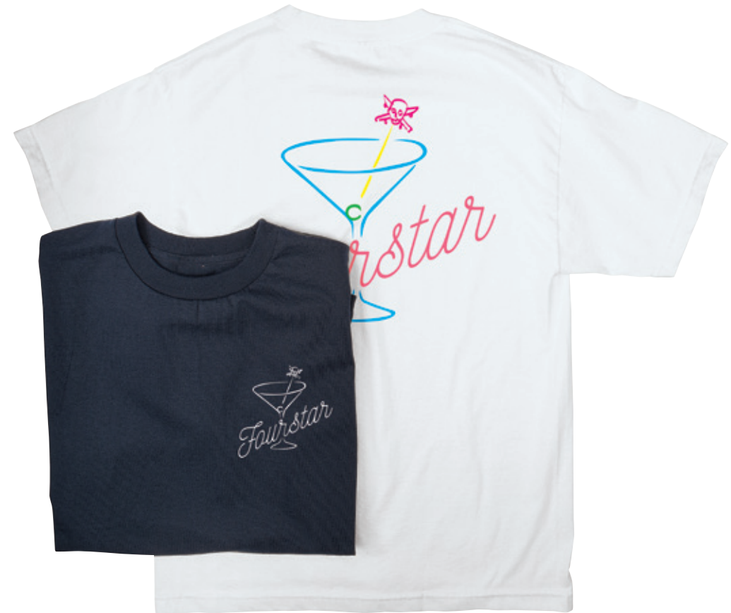
COCKTAILS STANDARD - FTS116011 100% Combed ringspun cotton with waterbased screen print. Standard Fit. Available in Navy & White.