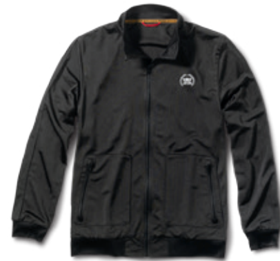
ISHOD TRACK JACKET - FS116608 Black