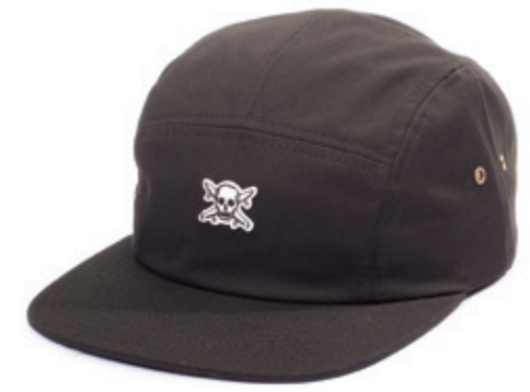
ICON CAMPER - FH116206 Traditional jockey fit camper with double side eyelets and pirate patch at front. Poly strap closure. Available in Black.