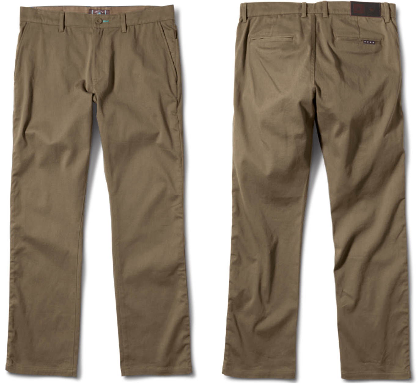
CARROLL TWILL STANDARD - FS116207-ST Mike Carroll signature style. 8.5 oz cotton twill chino with 2% stretch. Enzyme washed. Traditional slash pockets and rear welt pockets. Khaki herringbone waist lining, pocketbags and interior binding. Interior smart-phone pocket. Mike Carroll label package. Men's sizes 28-38 Colors: Khaki