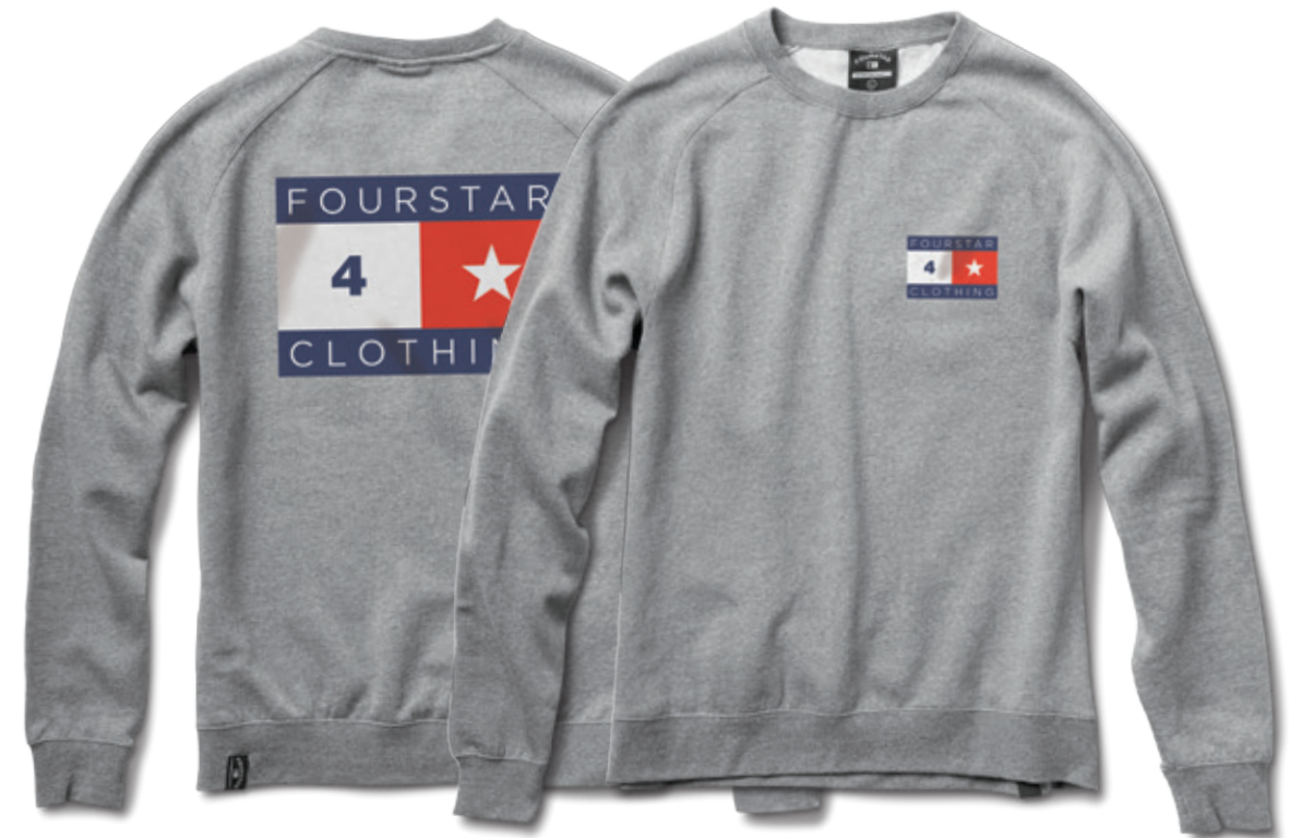
LOCKWOOD CREW - FSW116200 Cottonpoly blend crew neck. Standard fit. Available in Heather grey.