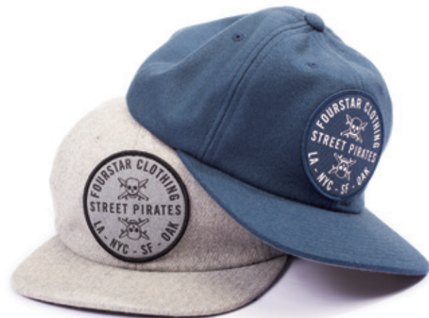
TWILL PATCH - FH116298 Unstructured wool snapback with marrowed edge twill patch. Available in Grey Heather & Navy.