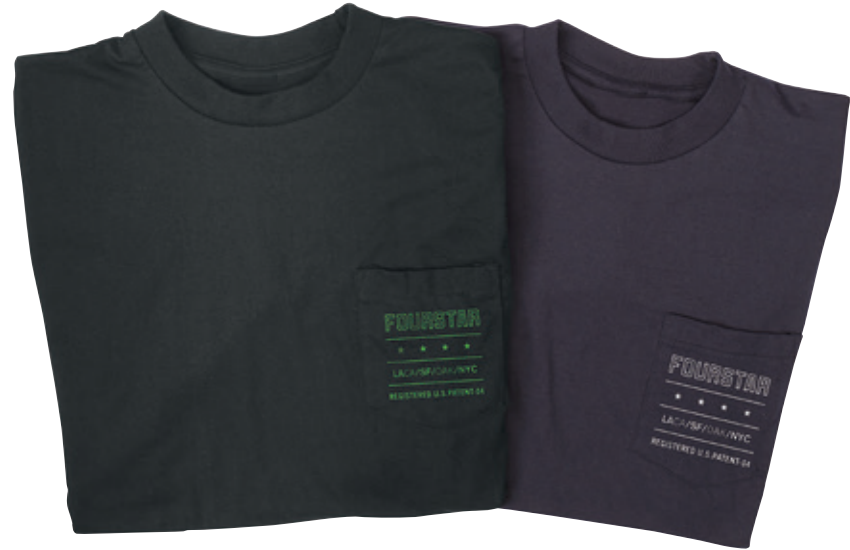
TYPE POCKET - FTS116101 100% Combed ringspun cotton pocket tee with waterbased screen print. Standard fit. Available in Black & Navy.