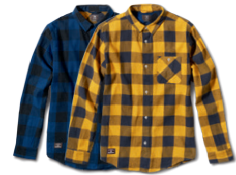
BUFFALO L/S - FS116401 Dark Royal & Mustard