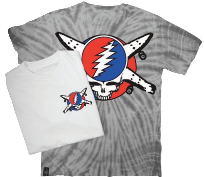
JERRY PIRATE STANDARD - FTS116012 100% Combed ringspun cotton. Standard fit. Available in White . JERRY PIRATE TIE DYE - FTS116900 100% Combed ringspun cotton with Tie Dye wash. Slim fit. Available in Charcoal Tie Dye.