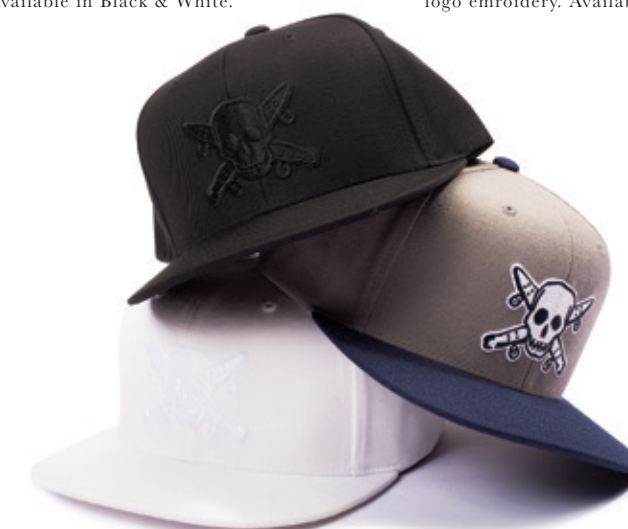
STREET PIRATE SNAPBACK - FH116204 Classic athletic snapback with snap closure. Street Pirate embroidery. Available in Whiteout, Blackout & Charcoal / Navy.