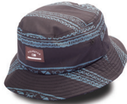
KENNEDY BUCKET - FH116211 Bucket hat with Kennedy Native stripe print. Available in Midnight. Sizes S/M & L/XL.