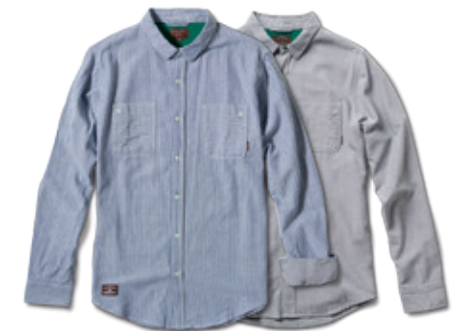
MARIANO OXFORD L/S - FS116403 Navy Pinstripe & Grey