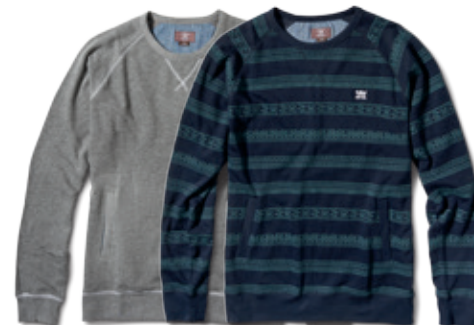
ATLANTIC RAGLAN - FS116583 Grey Heather & Midnight