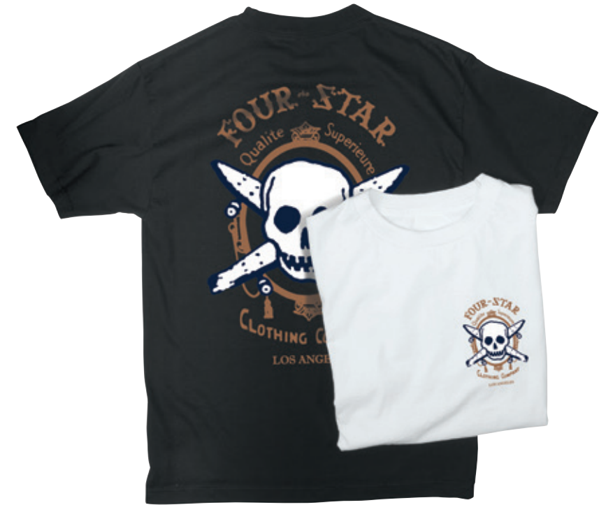
ZIG ZAG STANDARD - FTS116002 100% Combed ringspun cotton with waterbased screen print. Standard fit. Available in Black & White.