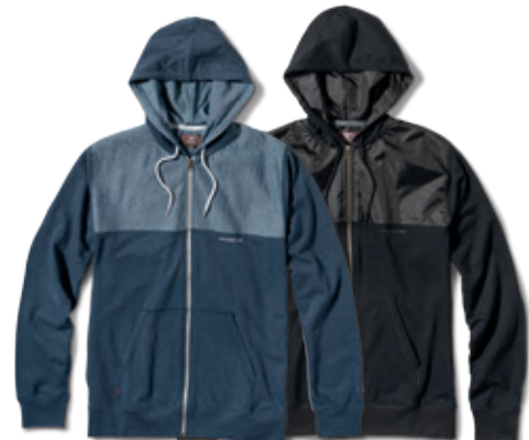
FIGUEROA ZIP - FS116582 Thundercloud Heather & Black