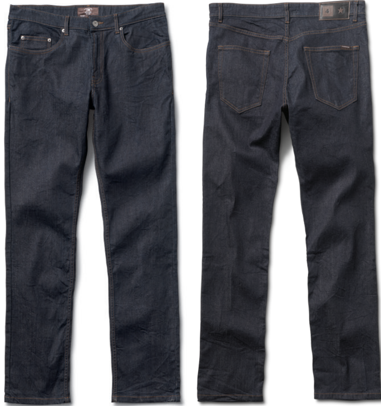
COLLECTIVE JEAN STRAIGHT SLIM - FS116100-SS 9 oz cotton denim with 2% stretch. Five-pocket silhouette. Collective label package. Men's waist size 28-38 Wash 1: Indigo Rinse: Dark indigo stretch denim with minimal rinse wash and golden-brown stitch.