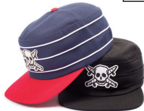
PIRATE PILLBOX - FH116296 Traditional pillbox style snapback with Pirate Patch and appliqued piping. Available in Navy & Black.