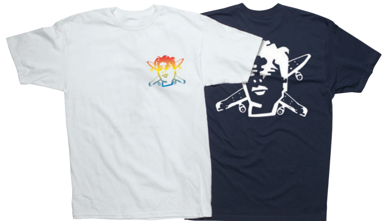
PIRATE VISION STANDARD - FTS116004 100% Combed ringspun cotton with waterbased screen print. Standard fit. Available in White & Navy.