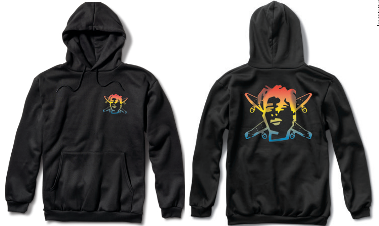
PIRATE VISION HOOD - FSW116100 Cottonpoly pullover fleece. Standard fit. Available in Black.