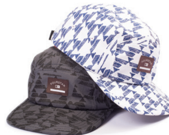
MONTANA CAMPER - FH116205 Traditional jockey fit camper with custom geometric printed cotton poplin. Poly strap closure. Available in Black & White.