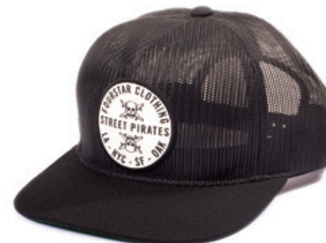
CIRCLE MESH TRUCKER - FH116208 Traditional trucker with all mesh panels & Poly urethane patch at front. Available in Black.