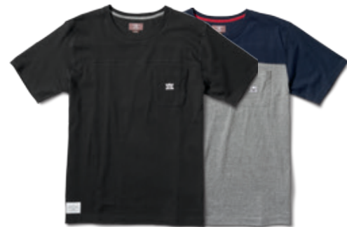
POCKET YOKE CREW - FS116350 Black & Grey Heather