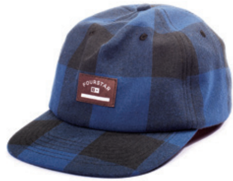
BUFFALO CAP - FH116210 Unstructured flannel cap with snap closure & woven label. Available in Dark Royal.