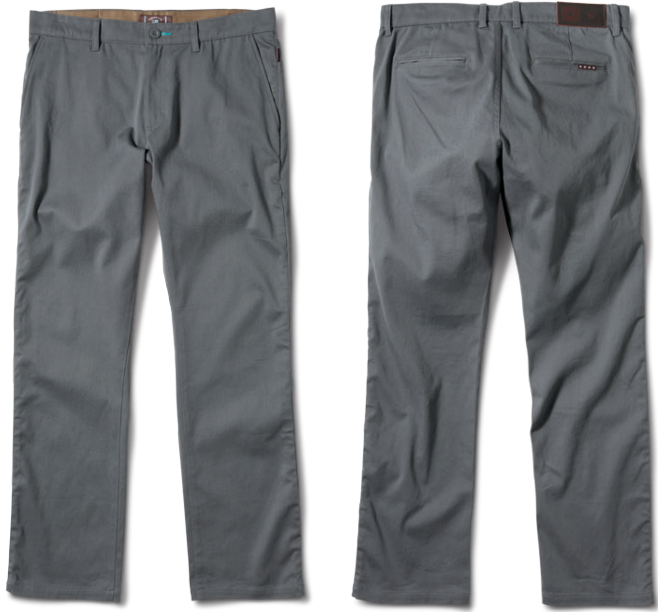
CARROLL TWILL STANDARD - FS116207-ST Mike Carroll signature style. 8.5 oz cotton twill chino with 2% stretch. Enzyme washed. Traditional slash pockets and rear welt pockets. Khaki herringbone waist lining, pocketbags and interior binding. Interior smart-phone pocket. Mike Carroll label package. Men's sizes 28-38 Colors: Charcoal