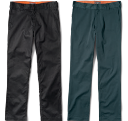
MAX WORKPANT - FS116235-WK Dark seafoam & Black