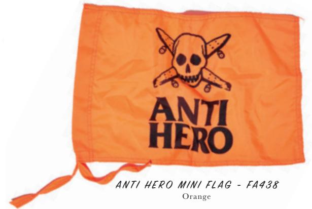
ANTI HERO MINI FLAG - FA438 Orange