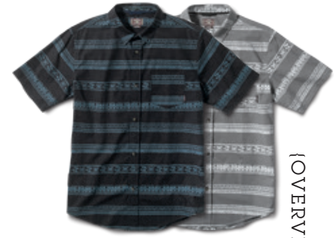
KENNEDY S/S - FS116499 Midnight & Grey