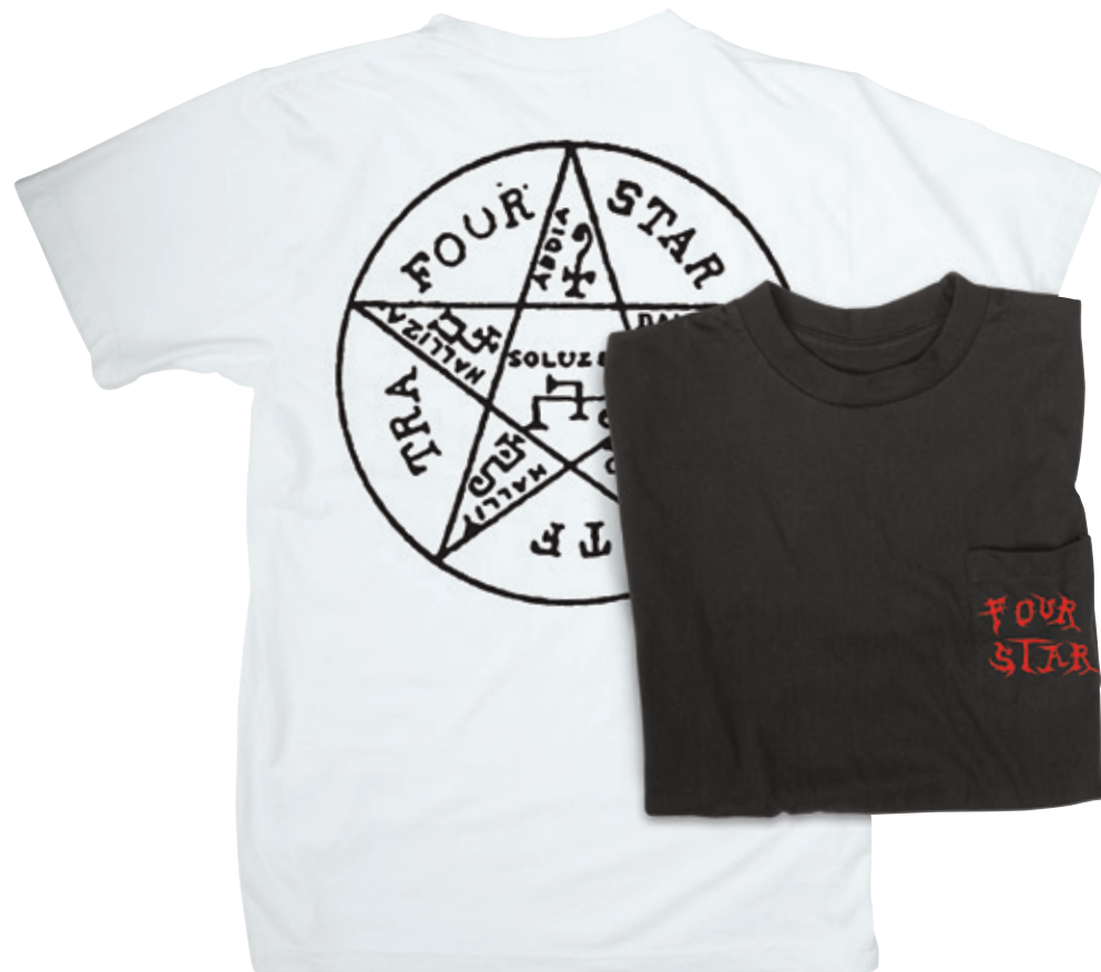
ZODIAC POCKET - FTS116100 100% Combed ringspun cotton pocket tee with waterbased screen print. Standard fit. Available in White & Black.