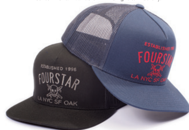
CLASSIC TRUCKER - FH116201 Traditional mesh back trucker with Classic embroidery at front. Available in Black & Navy.