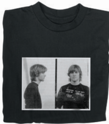
KURT MUGSHOT STANDARD - FTS116010 100% Combed ringspun cotton with waterbased screen print. Standard fit. Available in Black.