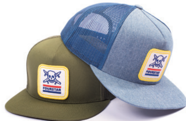
POSTMAN TRUCKER - FH116200 Traditional mesh back trucker with USPS inspired embroidered patch at center front. Available in Olive & Indigo.