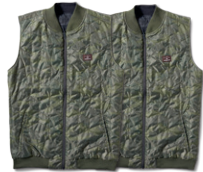
MARIANO REVERSIBLE VEST - FS116605 Camo / Grey