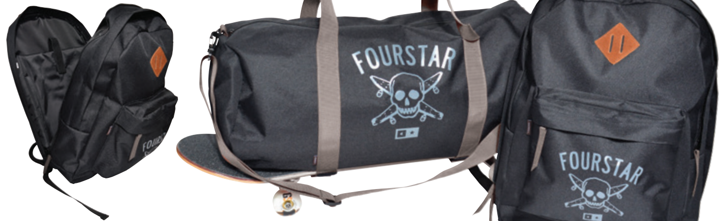
PIRATE BACK PACK - FA415

Mid-size nylon backpack with two full compartments including laptop sleeve, large front pocket and padded back panel. Luggage tag, logo print and Fourstar label package. Colors: Black