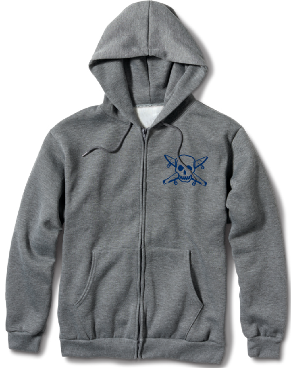
PIRATE FULL ZIP - FSW116301 Cottonpoly full zip fleece. Standard fit. Available in Grey Heather.