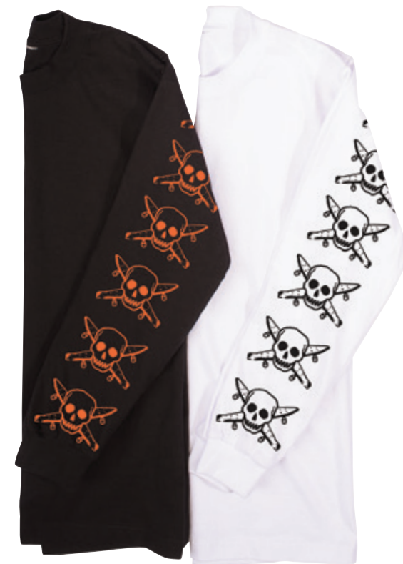
PIRATE CHAIN L/S - FTS116201 100% Combed ringspun cotton long sleeve. Standard fit. Available in Black & White.