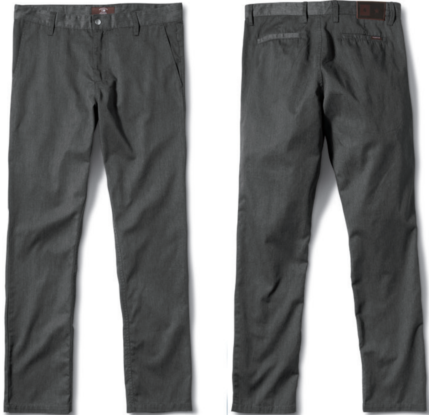
COLLECTIVE PANT STRAIGHT SLIM- FS116200-SS 6.5 oz 60/40 cotton/poly twill Rinse washed. Slash pockets and rear welt pocket Collective label package Men's sizes 28-38 Color: Charcoal Heather