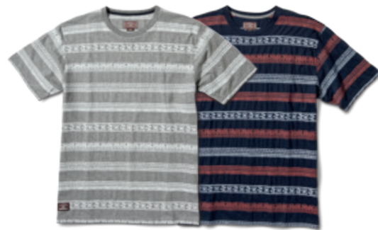
KENNEDY CREW - FS116347 Grey Heather & Midnight