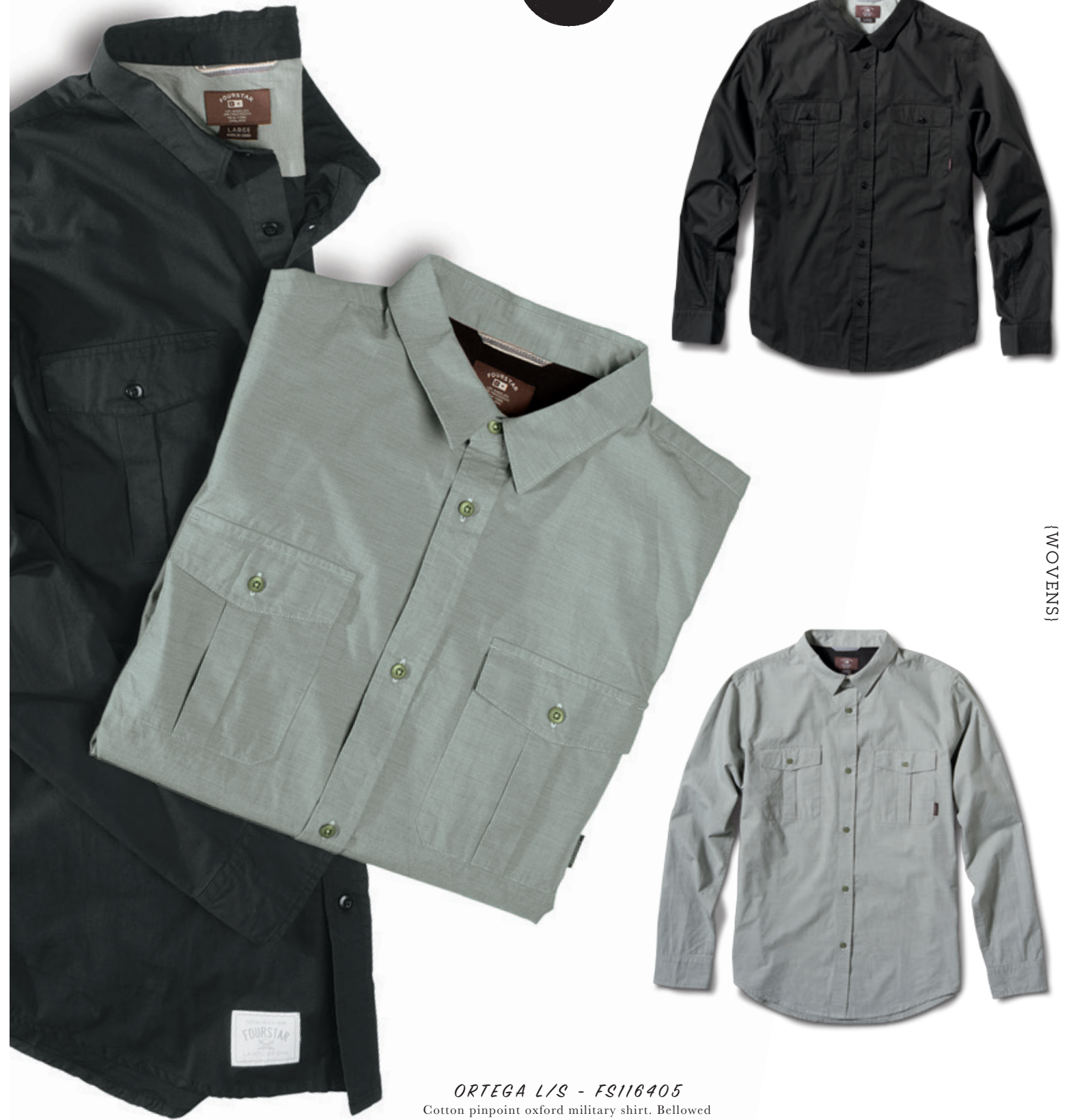
ORTEGA L/S - FS116405 Cotton pinpoint oxford military shirt. Bellowed double chest pockets. Contrast interior shoulder yoke. Collective label package. Men's sizes S-XXL. Colors: Black and Olive