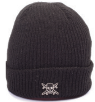
PIRATE FOLD BEANIE - FH116426 Acrylic fold beanie with pirate patch. Available in Turf Green, White & Black