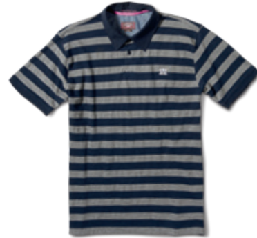
GONZ POLO - FS116342 Grey Heather