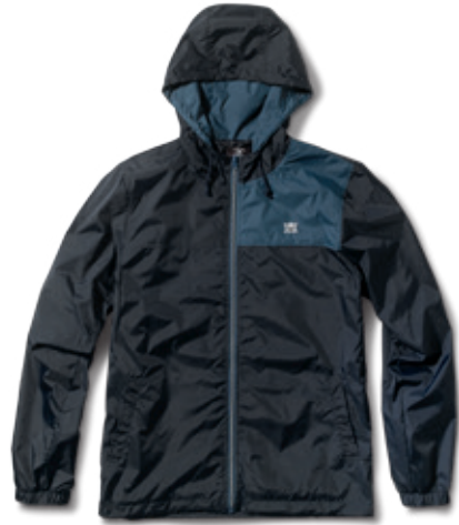
ATLAS JACKET- FS116602 Midnight