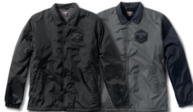
SHERPA COACH JACKET- FS116604 Black & Grey