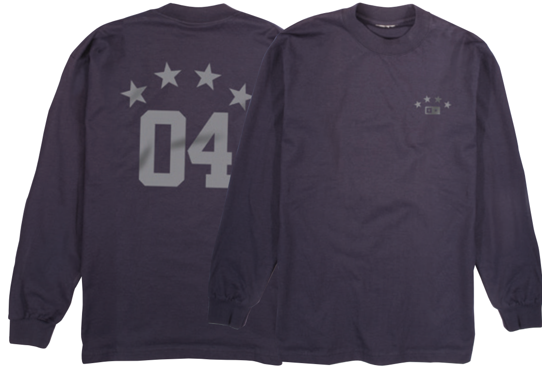
ATHLETIC LONG SLEEVE STANDARD - FTS116200 100% Combed ringspun cotton long sleeve. Standard fit. Available in Navy.