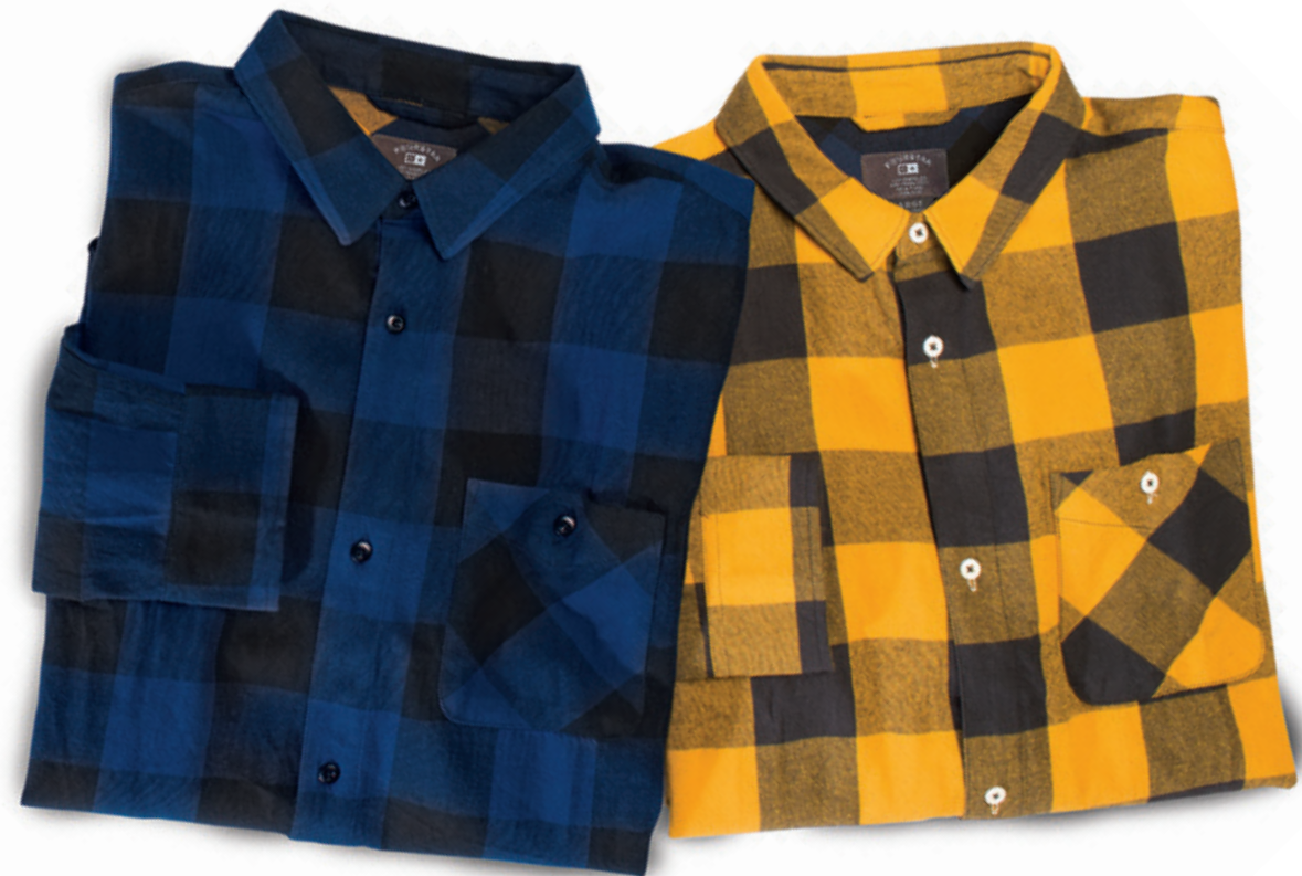
BUFFALO L/S - FS116401 Cotton buffalo flannel with left chest pocket. Contrast buttonhole stitch. Collective label package. Men's sizes S-XXL. Colors: Dark Royal and Mustard