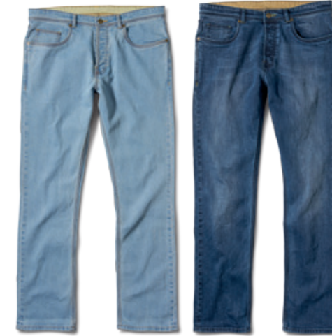
ISHOD DENIM STANDARD - FS116227-ST Indigo Superwash & Indigo Tonal