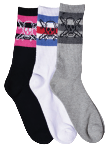
PIRATE STRIPE CREW - FA422 White / Black / Grey Heather