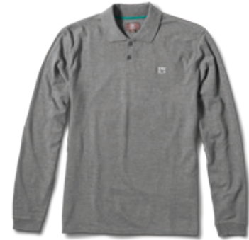
PIRATE L/S POLO - FS116345 Grey Heather