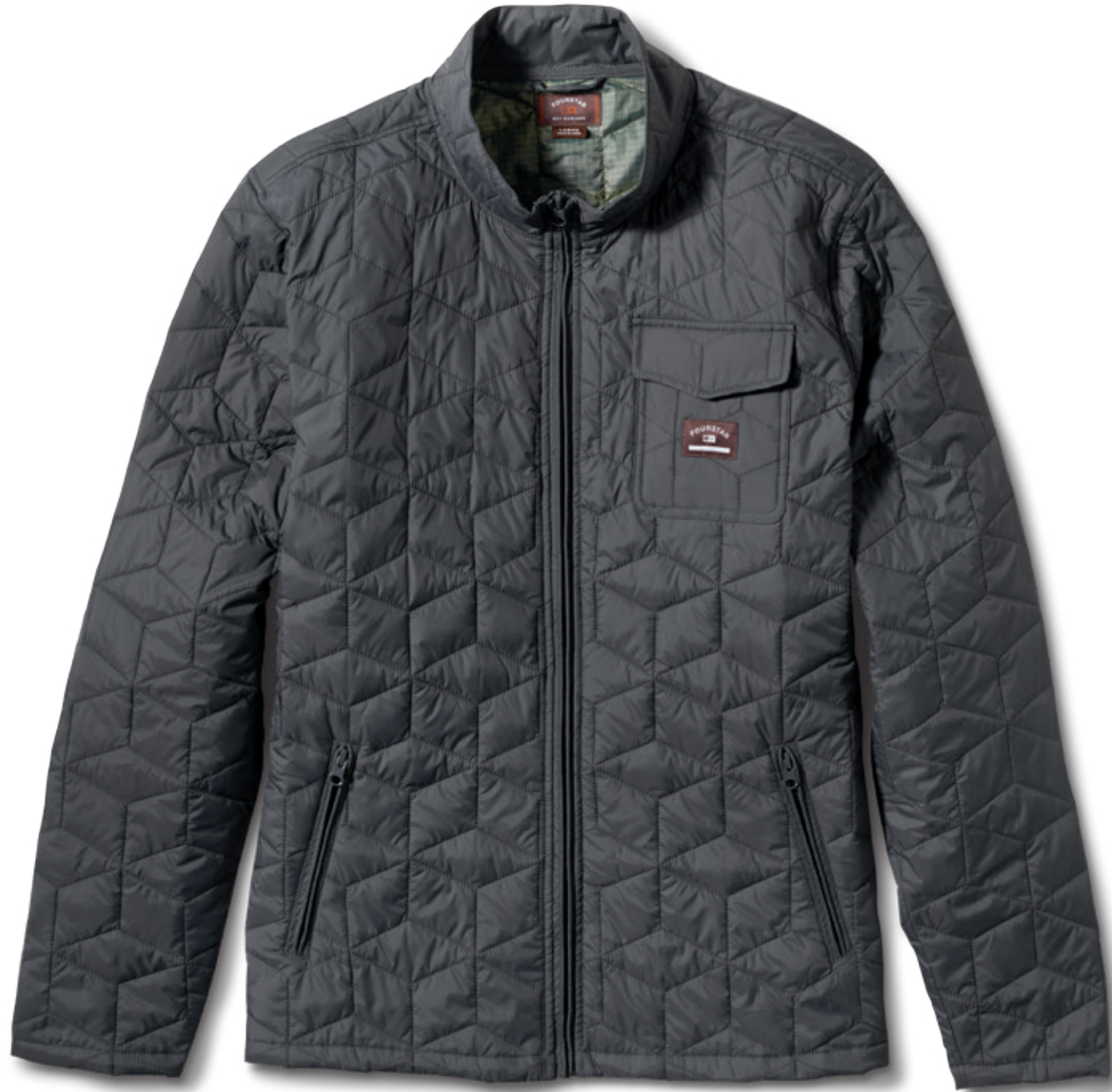
MARIANO CADET JACKET - FS116604 Guy Mariano signature style. Medium-weight puffy jacket custom 3-D quilt pattern. Welt pockets at waist. Cadet collar and rib waistband. Reverse Camo ripstop lining. Guy Mariano label package. Men's sizes S-XXL Color: Charcoal