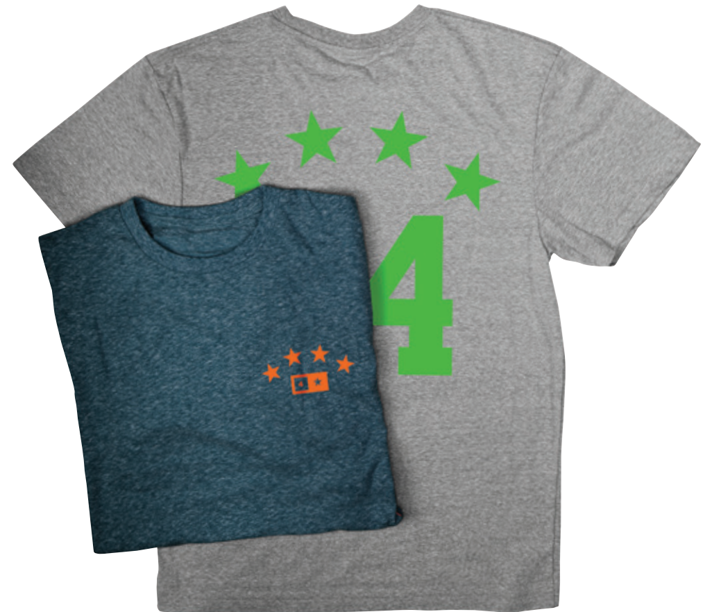
ATHLETIC TRIBLEND - FTS116501 Cottonpoly triblend with waterbased screen print. Slim fit. Available in Denim Heather & Heather Grey.