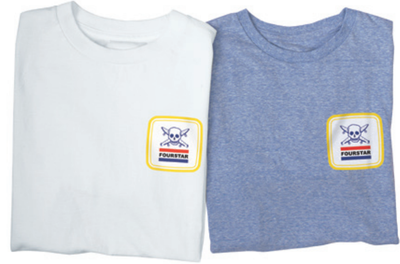
POSTMAN - FTS116001 White Colorway - 100% Combed ringspun cotton with waterbased screen print. Standard Fit. Heather Blue Colorway - Cottonpoly blend with waterbased screen print. Slim fit.