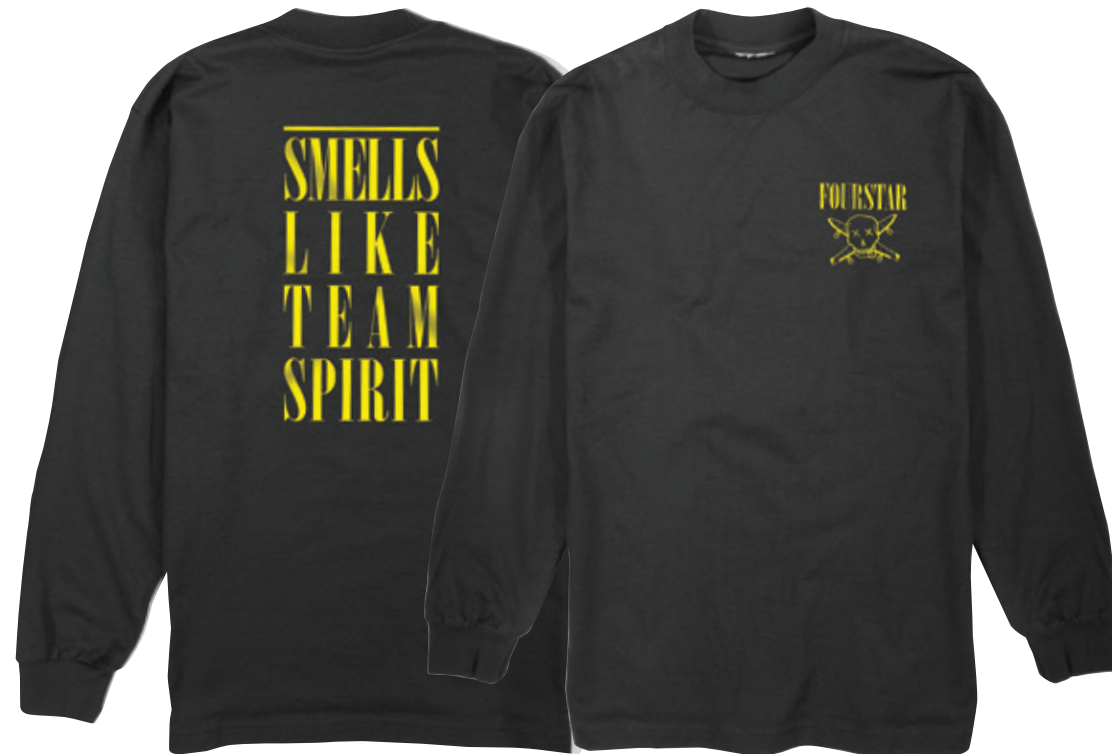
TEAM SPIRIT LONG SLEEVE STANDARD - FTS116202 100% Combed ringspun cotton long sleeve. Standard fit. Available in Black.