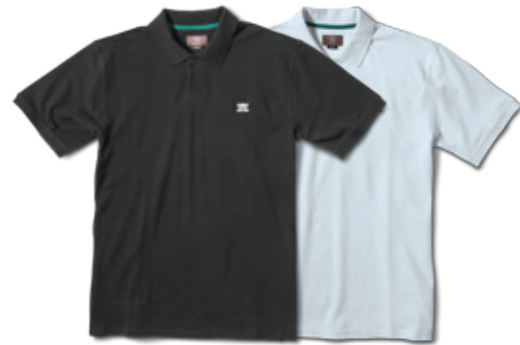
PIRATE POLO - FS116341 Black & White