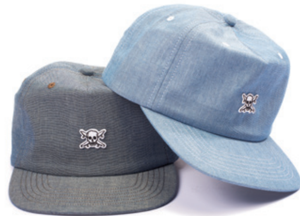
DENIM CAP - FH116299 Unstructured lightweight denim snapback with pirate patch at center front. Available in Midnight & Blue Sky.