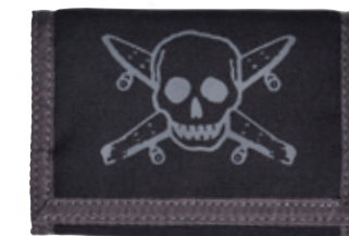
PIRATE WALLET - FA406 Black