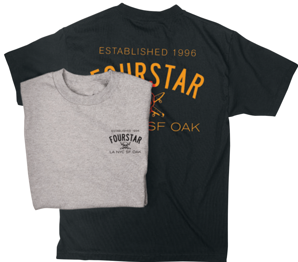
CLASSIC STANDARD - FTS116008 100% Combed ringspun cotton. Standard fit. Available in Heather Grey & Black.