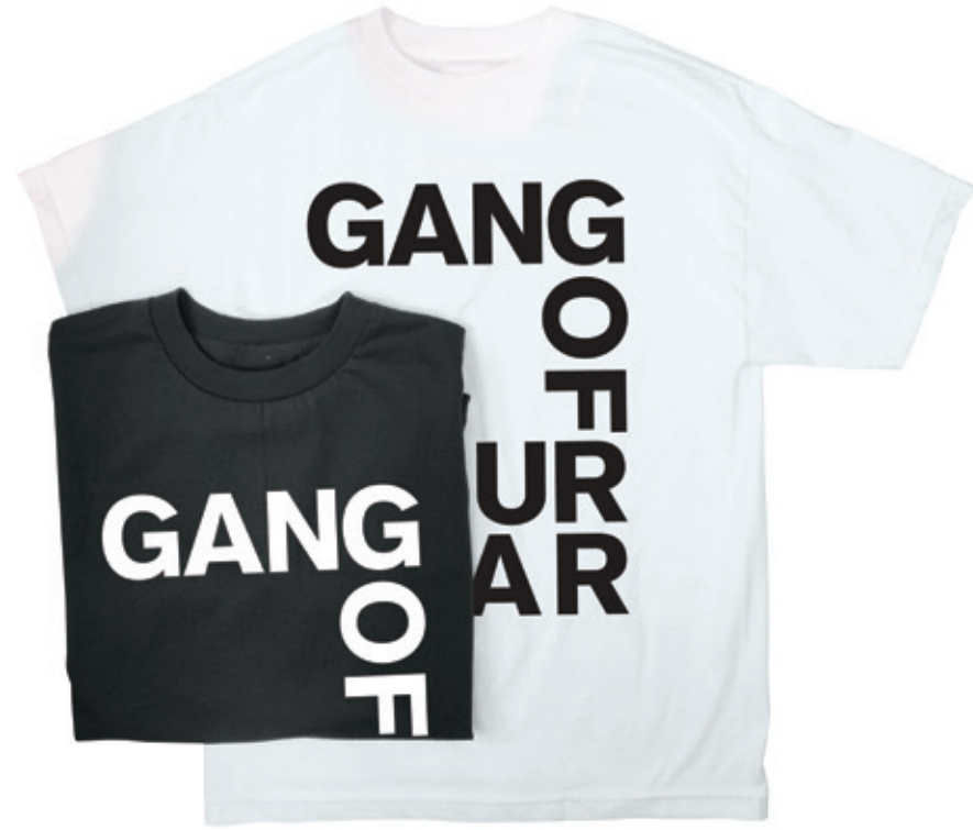
GANG OF FS STANDARD - FTS116007 100% Combed ringspun cotton with waterbased screen print. Standard fit. Available in Black & White.