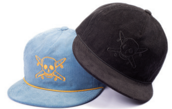
PIRATE CORD - FH116203 Vintage silhouette with corduroy crown and bill. Street pirate logo embroidery. Available in Bruin Blue & Blackout.