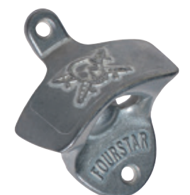
WALL MOUNT BOTTLE OPENER - FA441 Black