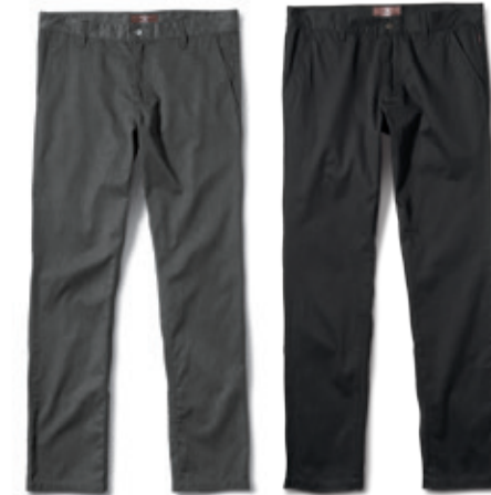
COLLECTIVE PANT STRAIGHT SLIM - FS116200-SS Charcoal Heather & Black