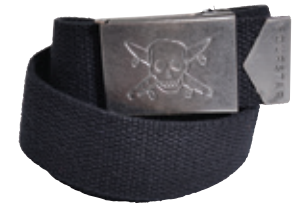
PIRATE BELT - FA405 Black