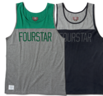
LEAGUE TANK - FS116344 Grey Heather & Black