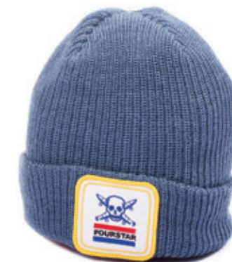
POSTMAN FOLD BEANIE - FH116429 Acrylic fold beanie with USPS inspired pirate patch. Available in Blue Heather.